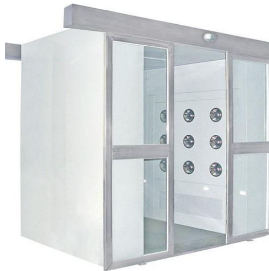
Hypoxia chamber for Human studies with Hypoxicator