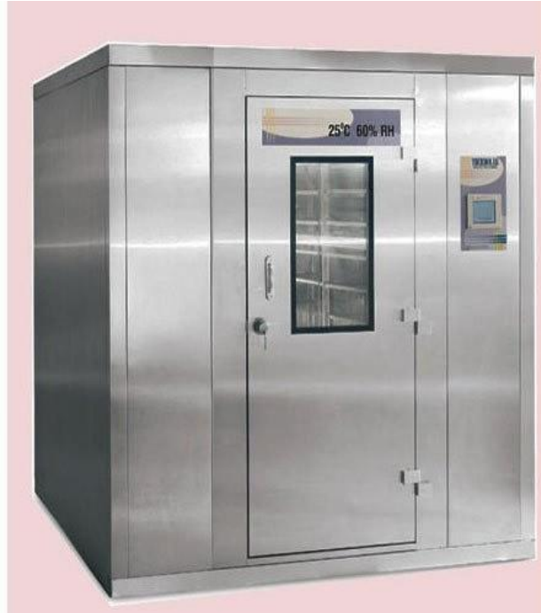
Hypoxia chamber for animal studies with Hypoxicator